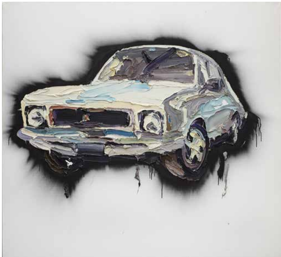
Torana 2007 oil and aerosol on linen 50 x 160cm Collection Goulburn Regional Art Gallery, donated through the Australian Government's Cultural Gifts program © the artist

Quilty continues to be baffled by the lack of social guidance in the transition from boyhood to manhood in white Australian culture. Referring to his own experience he states, 'Rites of passage? We made them up ... at your 18th birthday you drink alcohol (legally) and there is this expectation that you wake up the next day a man!' (3) Quilty's insights into the complexity of male youth are empathetic. He looks at the vulnerability of young men coming to terms with their own masculinity in an adult world and observes, 'There is a sensitivity, an openness and an awkwardness that is very beautiful in young men.' (3)