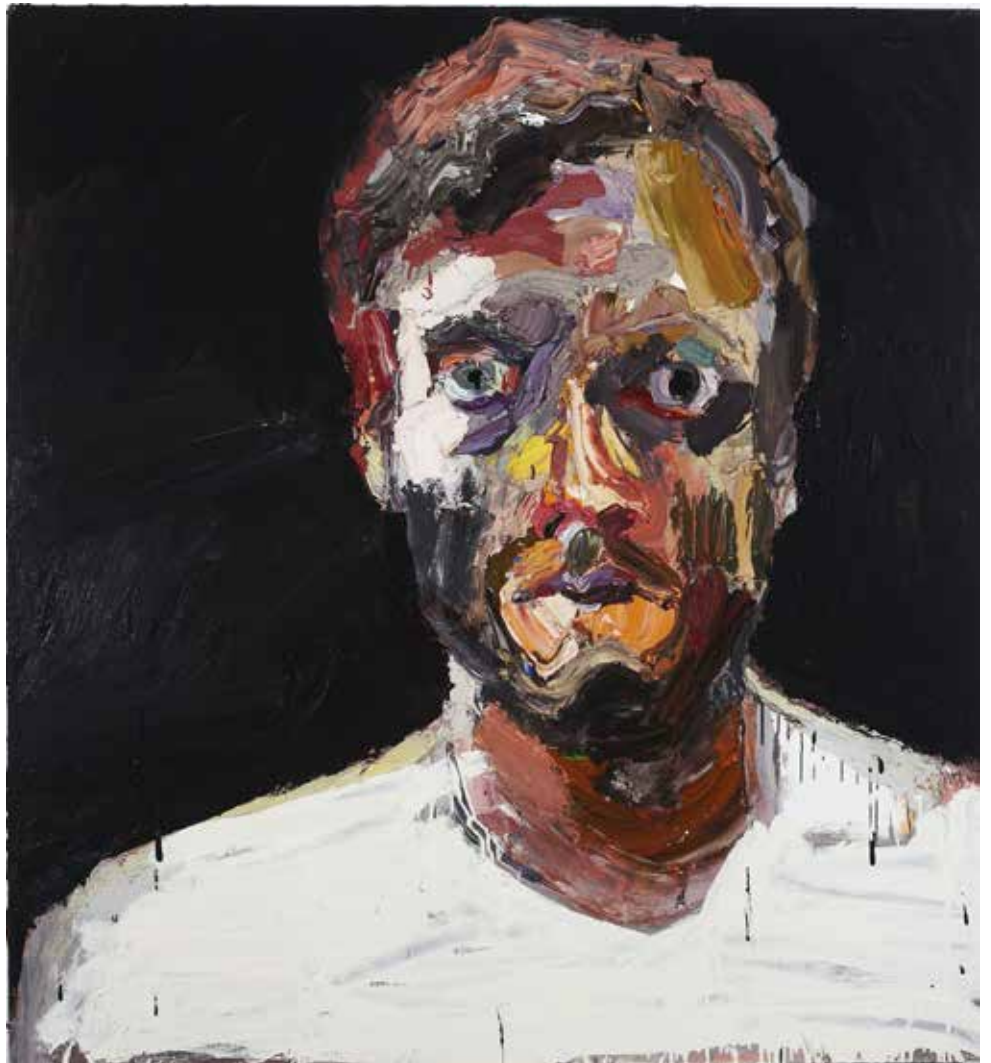
Self-Portrait After Afghanistan 2012 oil on canvas 130 x 120cm private collection

In After Afghanistan , soldiers he came to know in Afghanistan were asked to pick a pose that referenced one of their experiences. The resulting raw, confrontational nude portraits are more an investigation into emotional states and the psychological consequences of war than a portrait in the traditional sense. 'When I came back home,' he says, 'I realised I had a thousand photographs, but it was less about the likeness, less about the landscape, more about the human experience.' (3) The works in After Afghanistan have the dark expressionism of a Francis Bacon or Chiam Soutine painting, as do his own self-portraits from this time, for example, Self-Portrait After Afghanistan 2012.