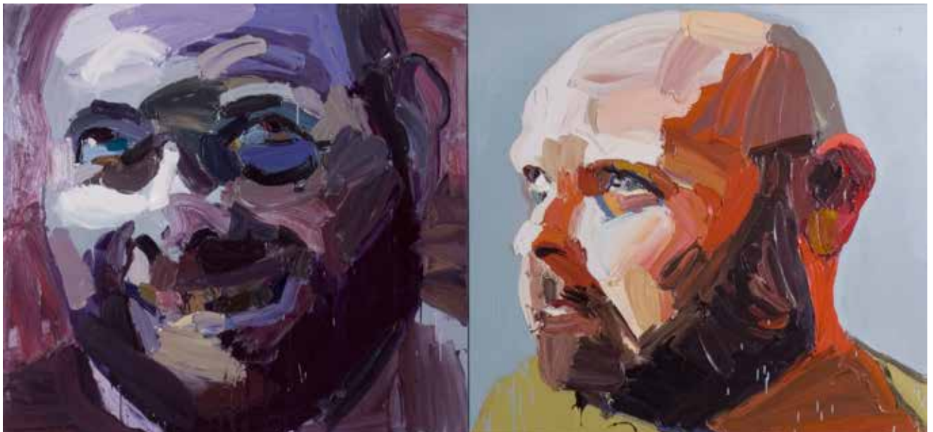
Cullen – before and after 2006 oil on canvas 150 x 320cm collection Newcastle Art Gallery

Quilty has also explored the dark links between creativity, addiction and potentially lethal excess, particularly of alcohol. In portraits of rock legend Jimmy Barnes ( Jimmy Barnes – there but for the grace of God 2009) and artist (the late) Adam Cullen ( Cullen before and after 2006) he depicts states of exhilaration brought on by drinking. One is reminded of Brett Whiteley's observation that 'many gifted people shipwreck' (5) when commenting on his own addiction. Quilty uses well-known adult male subjects who have famously battled their addictions while engaged in high-flying, creative careers. His approach is compassionate rather than damning, presenting another male following the crash-and-live/crash-and-die trajectory.