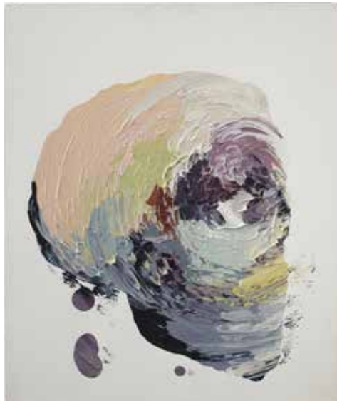
Skull Rorschach 2009 oil rorschach on linen diptych 60 x 100cm (each 60 x 50cm) Collection Goulburn Regional Art Gallery © the artist

Skull Rorschach 2009 turns what is usually a very sombre subject into a gloriously colourful, vibrant rendition of a skull, with its smeared and distorted Rorschach twin floating decoratively alongside. The artist veers towards Pop Art with its ironic take on images of commodity, although Quilty's gestural painting style evokes Larry Rivers and Robert Rauschenberg rather than Andy Warhol and Robert Lichtenstein. 'The only image more confronting (than images of living humanity) to the human should be the human skull, the head – devoid of flesh and hollowed out of consciousness and brain. At the death of the West's religious fervour the skull though has become a symbol of the human ideology of endlessness, a mocking reminder of the antiquity of religion. Still it remains for me a powerful part of my own portraiture,' says Quilty. (6) As Gillian Ridsale, curator of Public Programs at the University of Queensland Art Museum observes, 'It is as if he is trying to paint death into a corner.' (1)