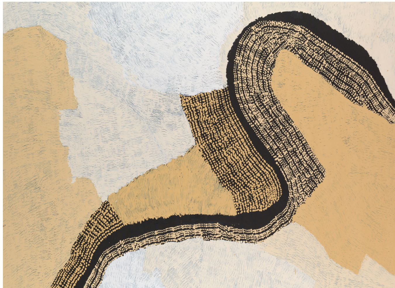
Above: Walungurru, 2020, Acrylic on Linen, 1700 x 1800 mm, Right: Ininti, 2020, Acrylic on Linen, 1700 x 1800 mm