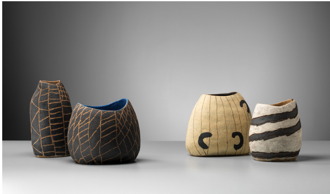
Above (Left-Right): Ininti , Ininti , Ilpili , Walungurru , 2021, Stoneware, photographer: Grant Hancock. Right (Left-Right): Walungurru , 2020, Stoneware, 530 x 220 x 220 mm. Walungurru , 2021, Stoneware, 230 x 200 x 190 mm photographer: Grant Hancock