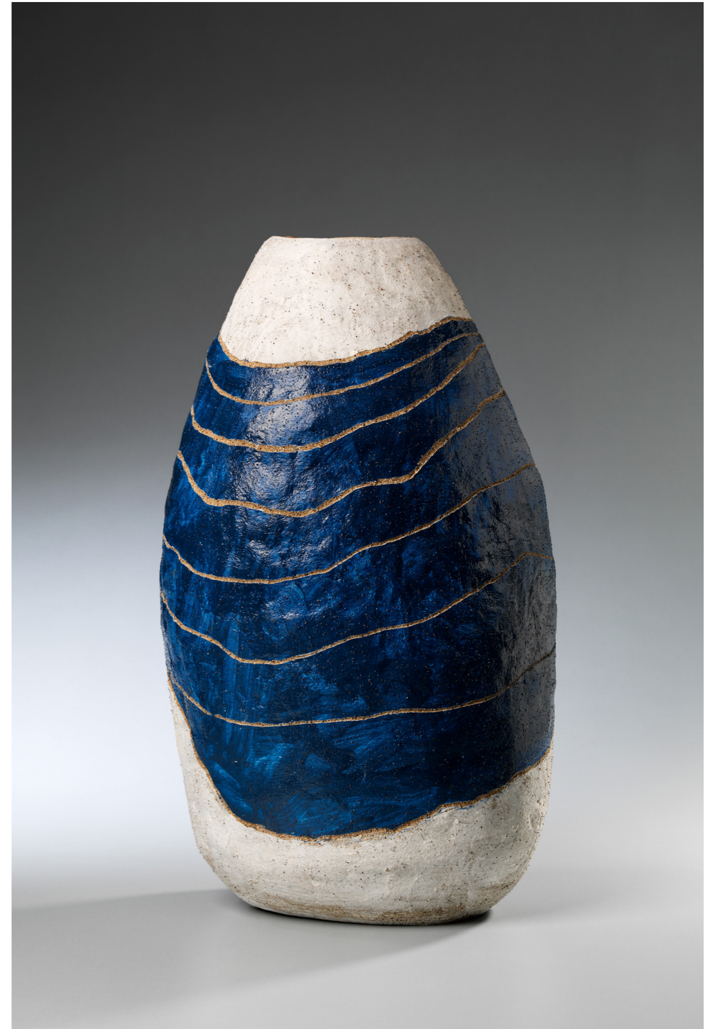
Right: Mumu , 2020, 510 x 400 x 400 mm (detail), photographer: Grant Hancock. Back page: Yumari , 2020, Stoneware, 610 x 350 x 280 mm, photographer: Grant Hancock.

Yankunytjatjara: (young-kun-jarrah) Aboriginal group in Central Australia (in the north-west of South Australia) and a dialect of the Western Desert Language. Literally means the people who use ' yankunytja ' to say 'going'.