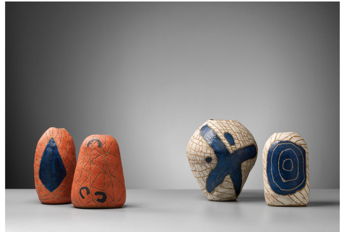
Left: Ilpili, 2020, Stoneware, 540 x 330 x 255 mm, Above (Left-Right): Kiwirrkura, Ilpili, Yumari, Walungurru, 2021, Stoneware