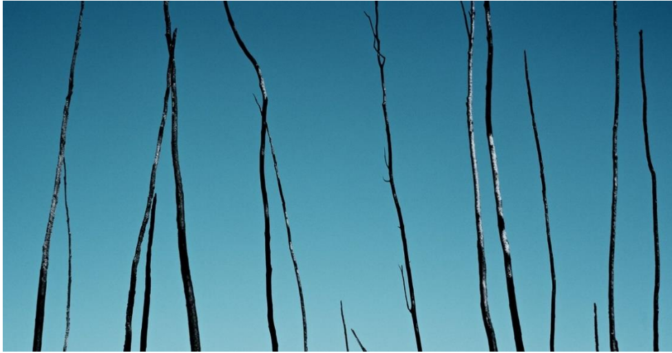
Tim Georgeson Requiem , 2020 colour inks on paper