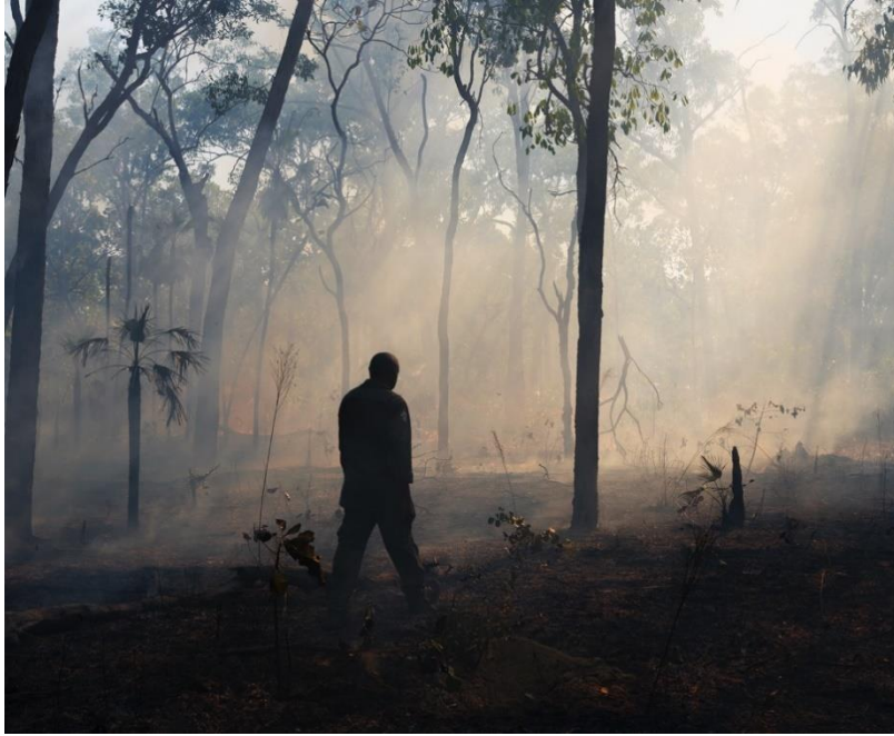
Tim Georgeson Victor , 2021 [cropping permitted] colour inks on paper