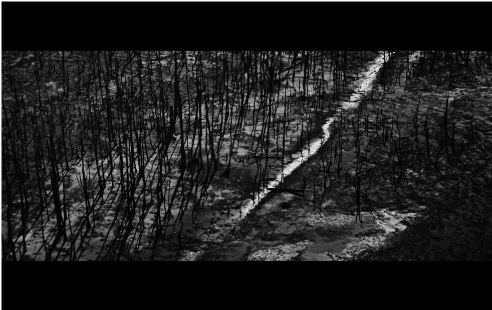
Tim Georgeson Still from Requiem for a forest , 2020 single-channel, HD moving image, with sound. Duration: 4:44 min